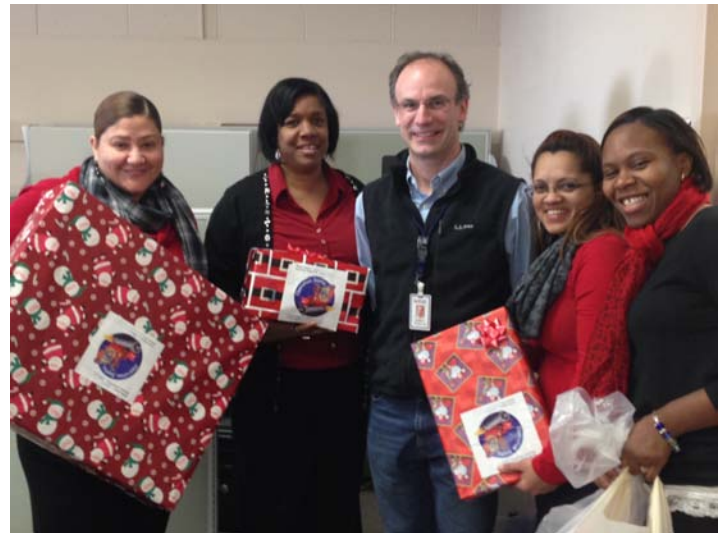
Supportive Housing Case Managers accept donated holiday gifts for their clients.

Eversource Foundation, Inc. The Gabelli Family Philanthropic Fund Heineman-Wallace Family Foundation AHEPA Hartford Foundation, Inc. Raymond James Charitable Endowment Fund United Technologies Charity Trust The Solomon and Katie Wohl Foundation