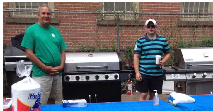
For the second year, Hartford Elks Lodge #19 held a cookout for the residents at St. Elizabeth House. This year they also donated a brand new grill.