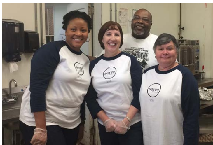
Liberty Mutual chose Mercy for their "Serve with Liberty" Volunteer Day.