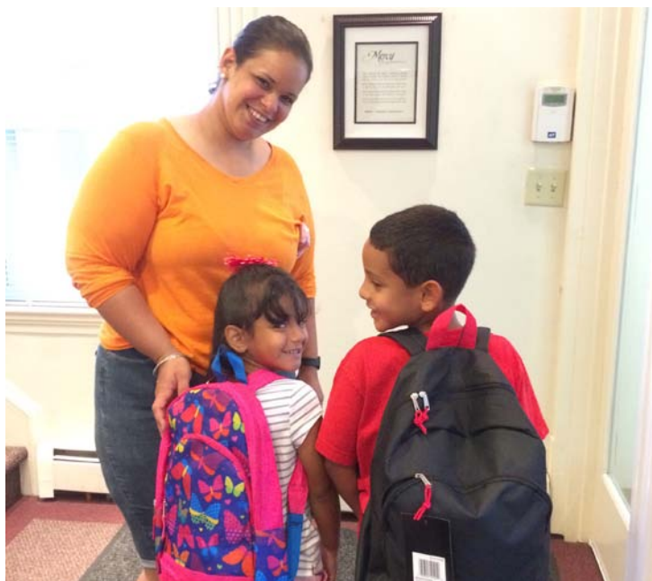
Back to School! The children of a client were grateful for their new backpacks and school supplies.