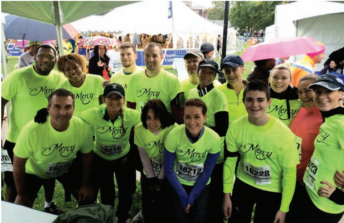
BlueBack Advisors teamed up with ProEx Physical Therapy to create the "Mercy in Motion" Team in training for last years Eversource Hartford Marathon. The team ran in support of Mercy and donated a portion of their registration fee.

Mercy Housing and Shelter Corporation, provides housing assistance and supportive services to persons who are homeless or at risk of becoming homeless.