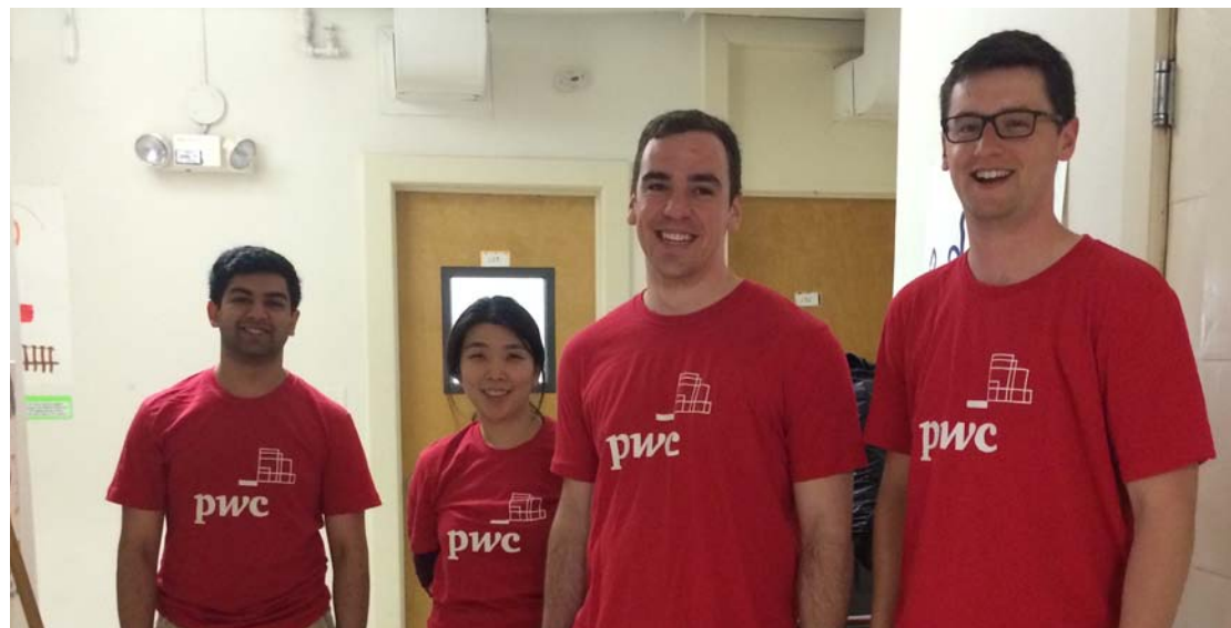
PricewaterhouseCoopers spent their Volunteer Day helping us with some spring cleaning.